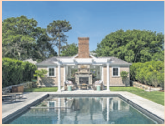
Brick-built structure in Martha’s Vineyard, Massachusetts, by Brooks & Falotico

maximise his Belgian project’s exposure to the available sun and retain heat through insulation, pool houses in southern Europe need to offer respite and shade.