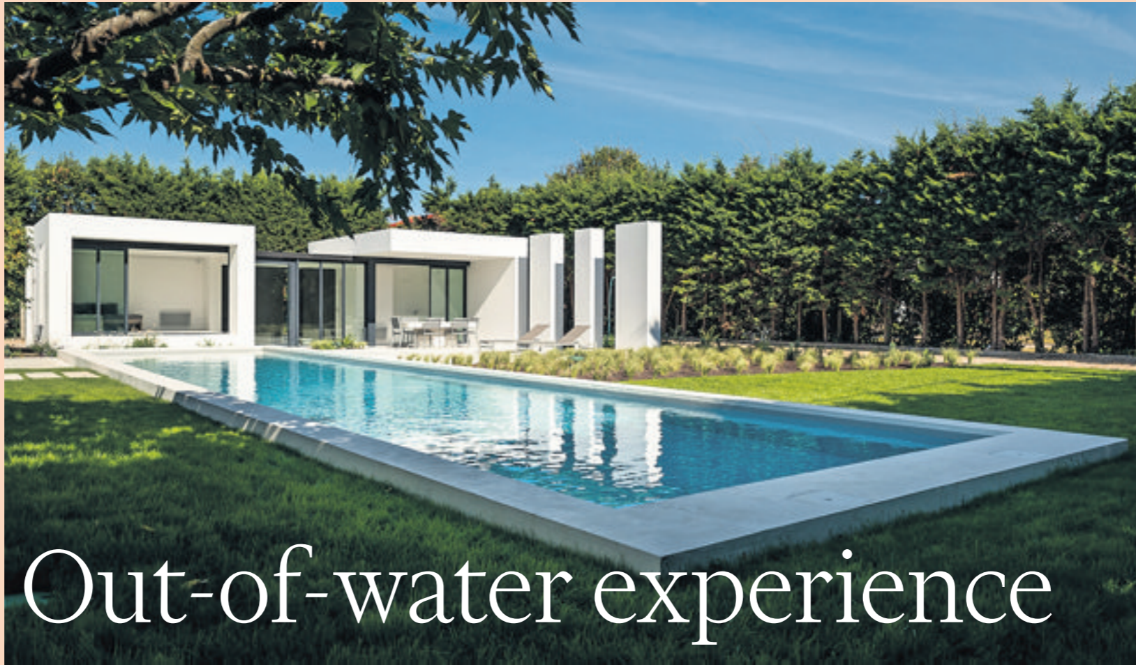
A pool house in Biarritz, France, designed by Atelier Delphine Carrère