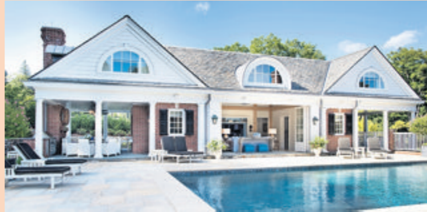
A pool house by Brooks & Falotico in Greenwich, Connecticut

The pool and pool house were designed to fit around several old olive trees and the water for the pool is kept clean through a low-chlorine natural filtration system. Barr says of the house, “because it is embedded in the land, it is cool.” In recognition of the ultimate symbol of summer freedom, she adds: “It is nice not to have doors.”